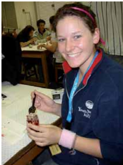
Practical science-based activities at the National Youth Science Forum

It was also a great opportunity for the talented students to visit Monash University to see the range of facilities and services available, as well as to find out about the range of courses on offer.